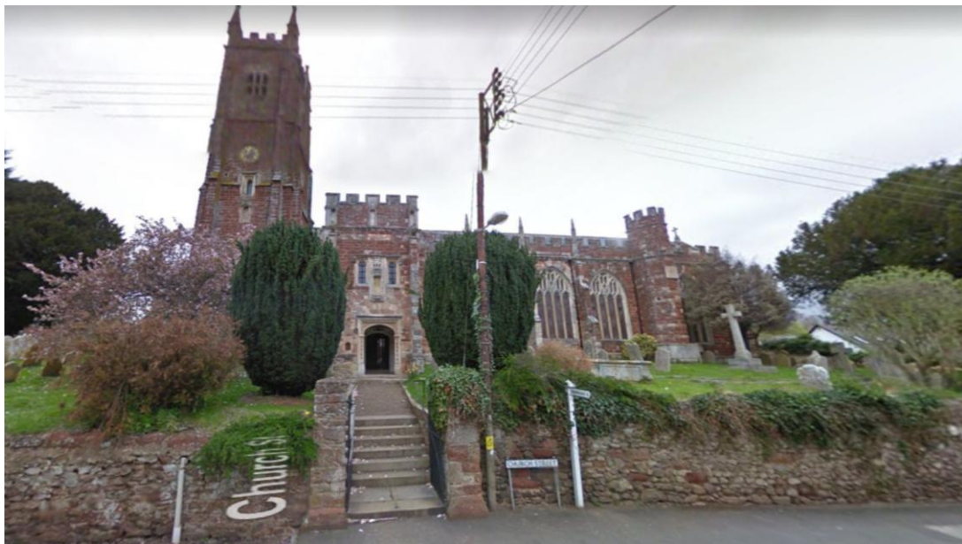
All Saints Church, Kenton, Exeter, EX6 8LU

The Hall has a maximum capacity of 200 people.